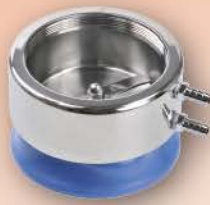
冷卻型粉碎杯(150ml) Cool type container