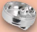
標準蓋 Standard lid