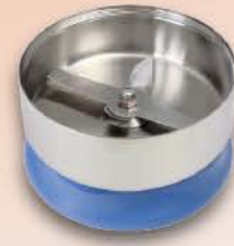
大容量粉碎杯(200ml) Large cap. container