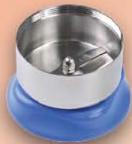
標準型粉碎杯(150ml) Standard container