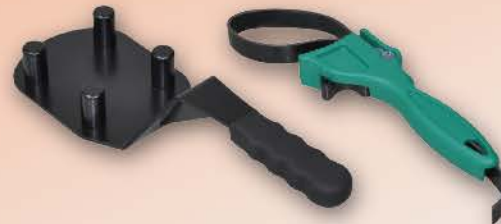
杯座拆裝工具組 (選購品) container dismantling tool set (Optional purchase)