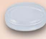
透明蓋 (選購品) Transparent lid (Optional purchase)