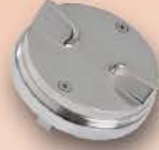
微量蓋 (選購品) Extra lid (Optional purchase)