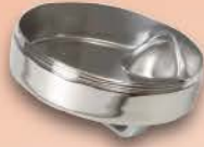
大容量蓋 Large cap. lid