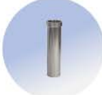
GT-1 / GT-2 GT-4 / GT-5