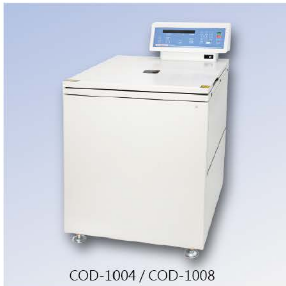
COD-1004 / COD-1008