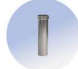
GT-1 / GT-2 GT-4 / GT-5